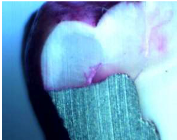
Figure 1: Microleakage evaluation under stereomicroscope shows a dye penetrating the enamel and spreading through the dentine-enamel junction (DEJ) to the dentin (score 3)

An interpreter, who was unaware of the groups, examined the gingival, axial, and occlusal margins of the segment corresponding to the central area of the tooth restoration using a stereomicroscope (Olympus, Tokyo, Japan). The degree of microleakage was assessed using a standardized ranking method [6], in which 0, 1, and 3 denote no dye infiltration, dye passage anywhere along enamel, dye entry on the Dentine-enamel Junction (DEJ), but not across the axial wall, respectively. Moreover, 3 shows dye permeability along an