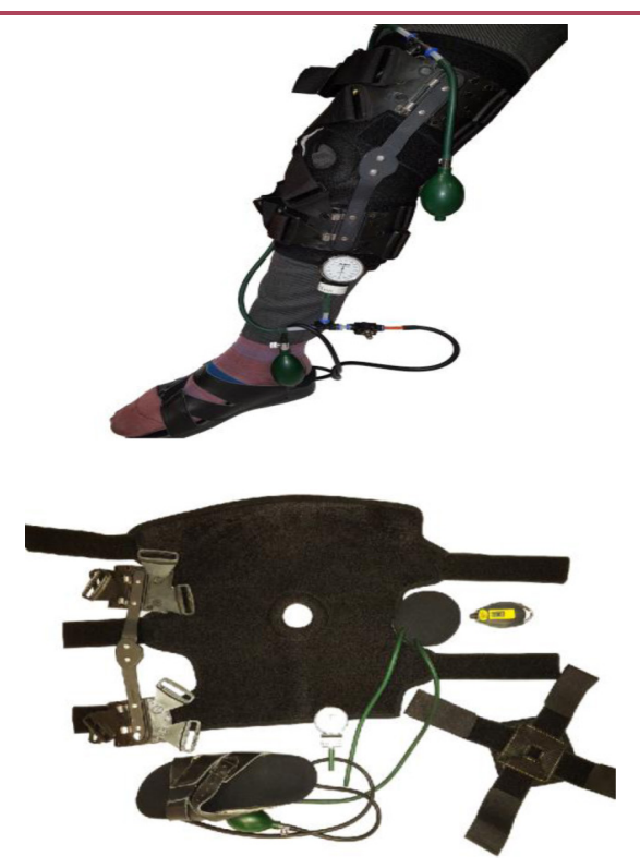
Figure 2: Innovative orthosis

landing force, the foot cuff is pressed in stance level, causing air to flow inside it and entering the volume of air into the knee brace. This force is applied to the knee during weight loss in order to reduce the adduction moment to the affected knee. The volume of air added to the knee cuff returns to the lower cuff with the lifting of the weight at the swing stage; thus, the dynamic compressive force applied on the knee was proportional to the various stages of gait.