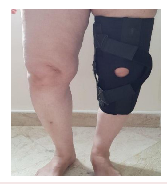
Figure 1: Conventional knee brace

In this study, two types of braces were used and evaluated for a patient including new orthosis and conventional brace. The conventional brace was neoprene knee brace and light weighing less than 500 grams, based on individual measurements. A metal bar on the inside of the knee and a soft pad on the outside of the knee were positioned so that the nonelastic straps were crossed over the hook attached to the metal load is clamped to the soft strap (Figure 1). This brace is applied through the system of three points of pressure to the knee of the valgus force. The designed knee brace structure, as shown in Figure 2, has tight shell, shank shell and pneumatic knee cuff. A pneumatic cuff is also fitted in the bottom of the medical slipper that was connected to the cuff section of the knee through the tube. The cuffs were filled with a manual pump from the air. The knee brace with a pneumatic mechanism can be applied on knee to correct that force. After the knee brace was deployed, its force can vary in different stages of the gait. This brace was associated with the tube to the plantar part of the medical sandals. During the