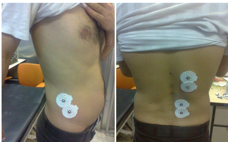
Figure 2: electrode placement for erector spine muscles (ESM) in areas of L3 and T9 and abdominal external oblique muscle (AEOM)

Biering-Sorensen muscle endurance (BSME) test was used in order to examine erector spine muscle MVC. To this end, subjects lay on their belly over the examination table, with their lower limb placed on the table and their anterior-superior iliac spine on its edge. Three straps were used to tie them to the table. In