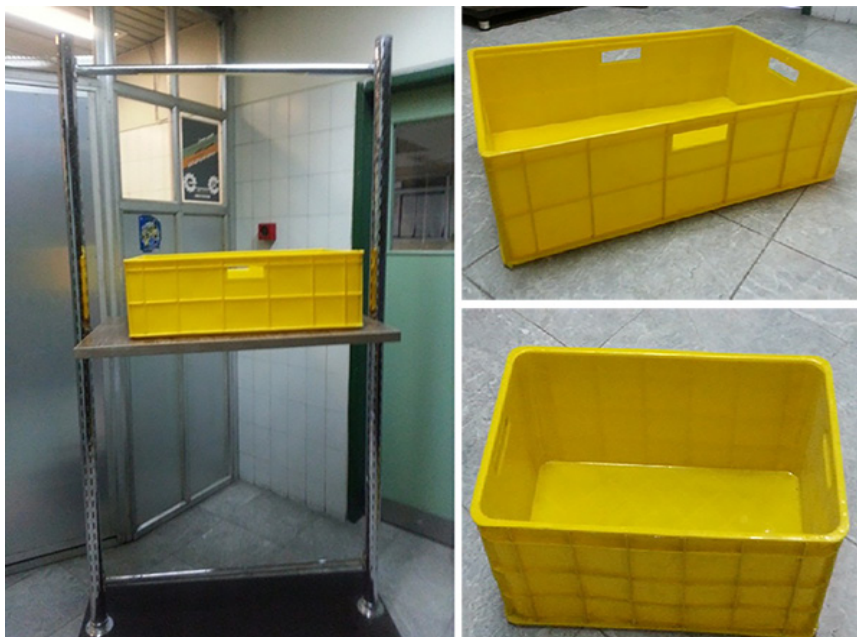
Figure 1: Height-adjustable shelves and boxes for handling lift

To optimize the electrical and mechanical connections before the placement of the electrodes, the surface of skin should be cleaned with alcohol. Thus, in order to reduce the Ohmic resistance of the surface of skin, the examiner first delicately removed a layer of skin by special abrasive sheet and then by ap-