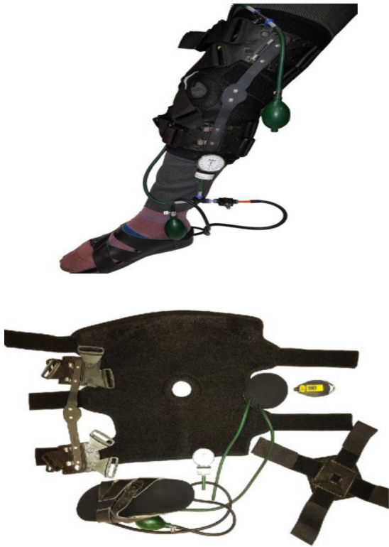
Figure 2: Innovative orthosis

landing force, the foot cuff is pressed in stance level, causing air to flow inside it and entering the volume of air into the knee brace. This force is applied to the knee during weight loss in order to reduce the adduction moment to the affected knee. The volume of air added to the knee cuff returns to the lower cuff with the lifting of the weight at the swing stage; thus, the dynamic compressive force applied on the knee was proportional to the various stages of gait.