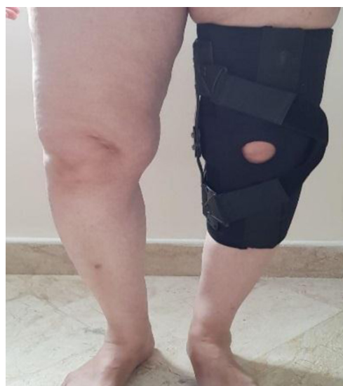
Figure 1: Conventional knee brace

In this study, two types of braces were used and evaluated for a patient including new orthosis and conventional brace. The conventional brace was neoprene knee brace and light weighing less than 500 grams, based on individual measurements. A metal bar on the inside of the knee and a soft pad on the outside of the knee were positioned so that the non-elastic straps were crossed over the hook attached to the metal load is clamped to the soft strap (Figure 1). This brace is applied through the system of three points of pressure to the knee of the valgus force. The designed knee brace structure, as shown in Figure 2, has tight shell, shank shell and pneumatic knee cuff. A pneumatic cuff is also fitted in the bottom of the medical slipper that was connected to the cuff section of the knee through the tube. The cuffs were filled with a manual pump from the air. The knee brace with a pneumatic mechanism can be applied on knee to correct that force. After the knee brace was deployed, its force can vary in different stages of the gait. This brace was associated with the tube to the plantar part of the medical sandals. During the