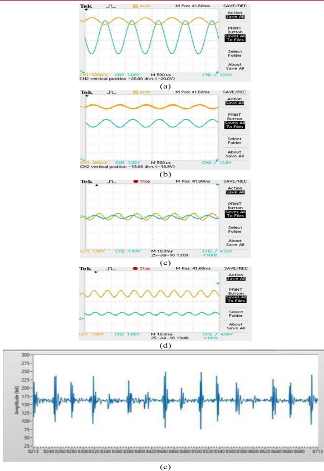
Figure 3: Output Signal on the Oscilloscope and LabVIEW in case studies: a) The Inverting Amplifier Circuit Output Signal with 400mV, b) The Inverting Amplifier Circuit Output Signal with 150mV, c) Output Signal Order 4 LPF Circuit 200 Hz Cutoff, d) Output Signal Order 4 HPF Circuit 20 Hz Cutoff, e) Heartbeat Signal Results in the LabVIEW Interface