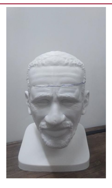
Figure 1: The general design of phantom.