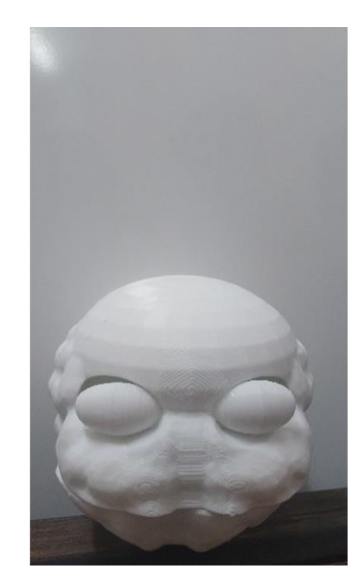
Figure 3: Places for eyes and ears to locate thermoluminescent dosimeter (TLD) .