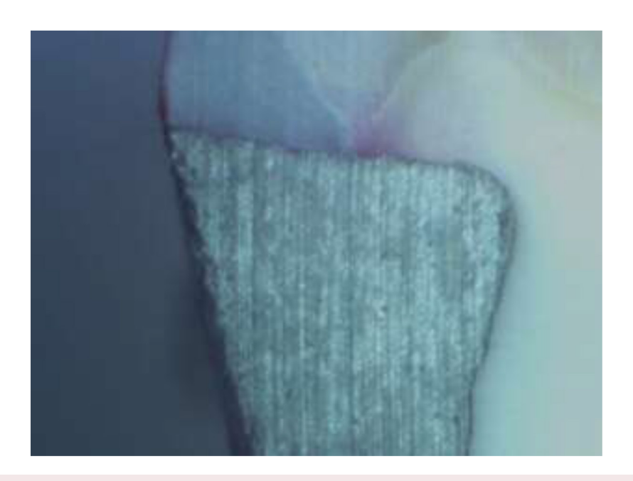
Figure 2: A sample control tooth under stereomicroscope microleakage evaluation reveals no dye penetration (Score 0)

Significantly more microleakage occurred in the G2, G3, and G5 groups than in the control group ( P -value=0.001, 0.002, and 0.01). However, the difference between the scores of microleakage in G4 and the control group was