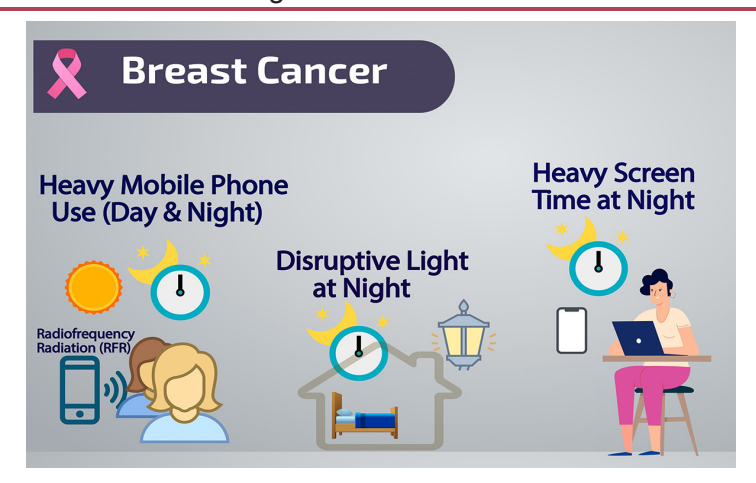
Figure 1: Illustration of exposure to artificial light at night (ALAN), originated from outdoor sources, such as streetlights and billboards, and indoor sources, such as electronic devices like TVs, smartphones, and laptops.