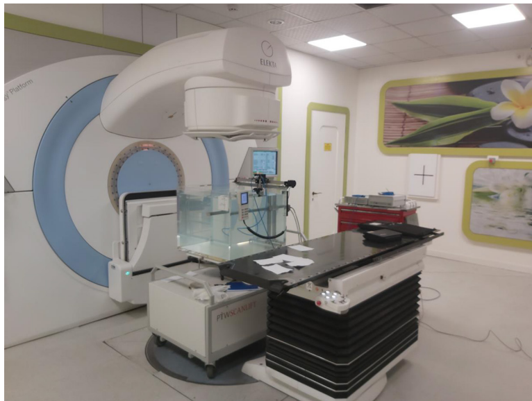
Figure 2: Absolute dosimetry was conducted using a linac (Elekta Synergy Platform) in conjunction with a Pole To Win (PTW) Motorized 3D water Phantom system (MP3) to measure the effective wedge angles.

factor), K_{elec} factor (electrometer calibration factor), K_{pol} factor (polarity correction factor), K_s factor (saturation or ion recombination correction factor), and K_{Q,Q_0} (radiation quality correction factor). Once these correction coefficients are applied, the absolute dose at the specified depth can be determined. Consequently, practical EWAs can be calculated using the relationships defined for the Elekta and ICRU-24 formulas. The positional accuracy of the PTW MP3 water tank scanner arm was verified using high-precision dial gauges, with mechanical precision estimated at \pm 0.1 mm across all three coordinate axes.